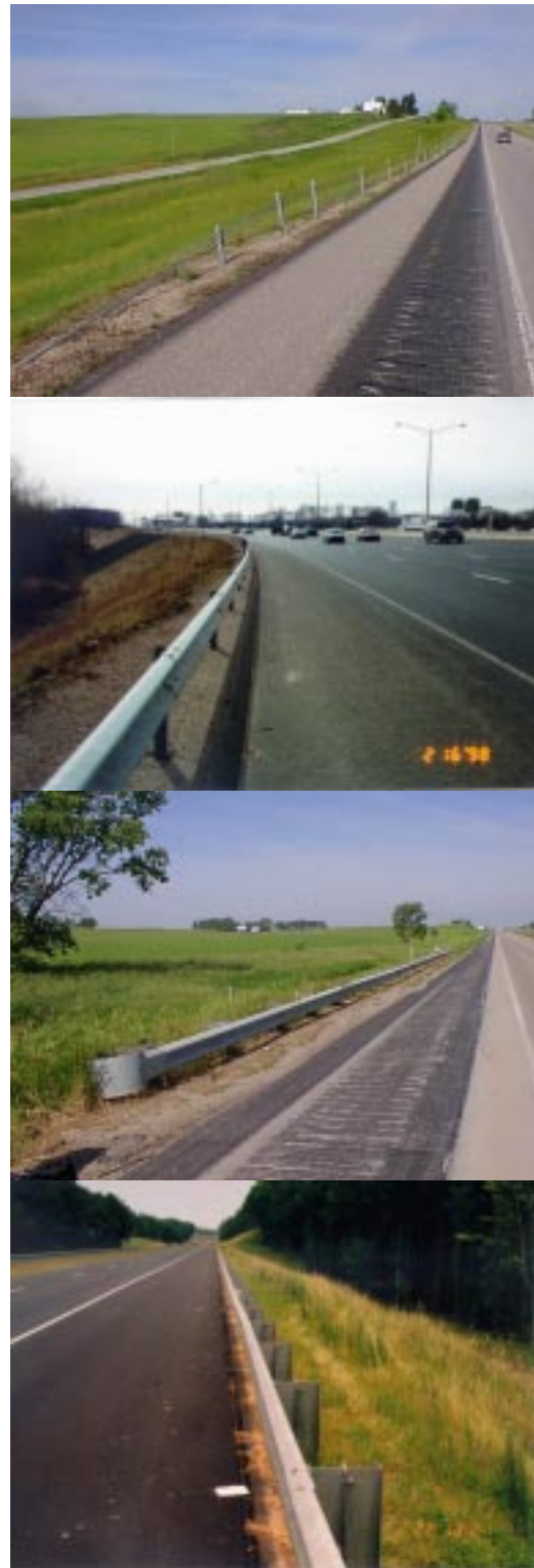
Figure 1: Typical installations of G1, G2, G4(1W), and G4(1S) guardrails (top to bottom)

The G4(1W) in Iowa and the G4(1S) in North Carolina are two versions of a blocked-out strong-post W-beam guardrail using a 2.67-mm thick steel “W” section and posts spaced at 1905 mm.(7) The strong-post W-beam guardrails are by far the most common type of guardrails in use today.(8) While there are a number of varieties of this system using different combinations of posts and blockouts, every state uses some type of strong post w-beam guardrail.(8) The G4(1W), a modified SGR04b shown in Iowa DOT’s Standard Road Plan as RE-12A, uses 200x200mm wood posts with wood blocks, whereas the G4(1S), or SGR04a, uses W150x13 steel posts with steel blocks.(7)(10)