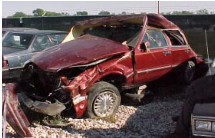
Figure 10. Vehicle after collision (Case I98092303).

The last bullnose transition collision (case I98112601) involved a pickup that penetrated the guardrail and hit a bridge pier. Two passengers suffered multiple major injuries, the driver and three other passengers suffered minor injuries, and the vehicle was destroyed. The total cost to repair the guardrail was $644. Figure 11 shows the repaired guardrail.