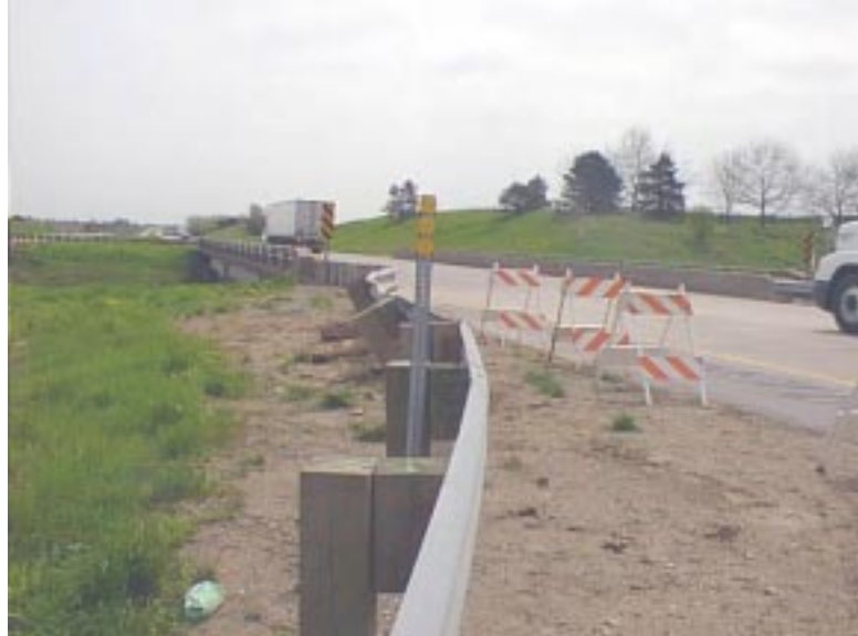
Figure 8. Bullnose damage (Case I98042701).

The next bullnose transition collision (I98092303) was an unusual collision in which the driver of a car lost control and spun around in the roadway. The vehicle slid backwards and hit the guardrail on the passenger side going backwards. The vehicle vaulted over the rail and flipped over, finally coming to rest on a railroad track below the twin bridges. The four occupants were injured severely, and the right rear passenger later died from his injuries.