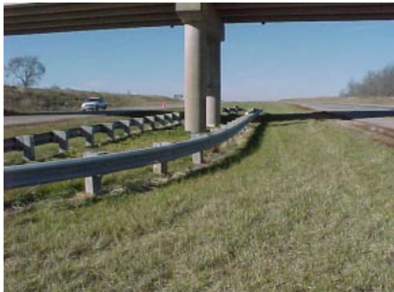
Figure 11. Case 98112601

The last bullnose transition collision (case I98112601) involved a pickup that penetrated the guardrail and hit a bridge pier. Two passengers suffered multiple major injuries, the driver and three other passengers suffered minor injuries, and the vehicle was destroyed. The total cost to repair the guardrail was $644. Figure 11 shows the repaired guardrail.