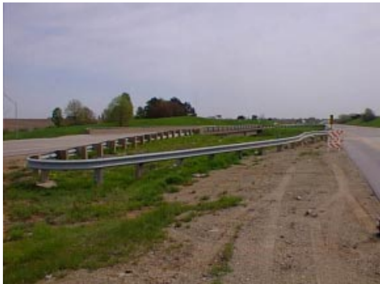
Figure 7. Vehicle approach path (Case I98042701).

The first bullnose transition collision (case I98042701) involved a Ford F350 pickup that hit the bullnose and was redirected across both lanes of traffic into a bridge railing on the other side of the roadway. The driver and right rear passenger suffered major injuries to the upper torso, and the other two passengers suffered minor injuries to the upper torso. The cost to repair the guardrail was $746. Figures 7 and 8 show the bullnose after this collision.