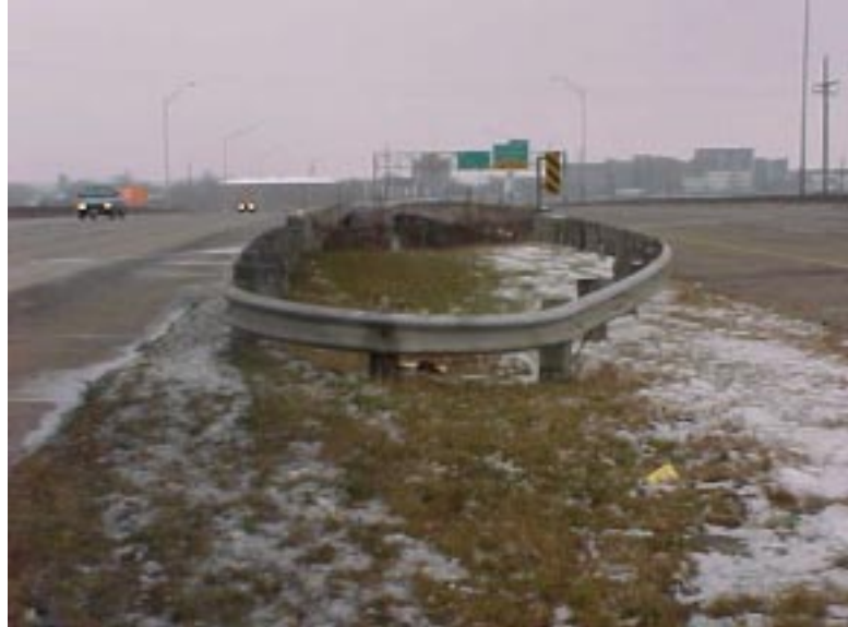
Figure 6. Repaired bullnose after an end-on collision (Case I98060502).

The other nose collision (case I98060502), which occurred in the rain, involved a passenger car that was stopped in contact with the bullnose. The driver, who was the only occupant, suffered multiple major injuries. Repairs to the guardrail cost $1390. Figure 6 shows the repaired bullnose in this case.