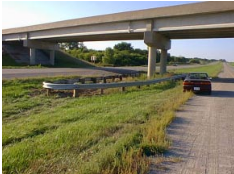
Figure 1. Typical bullnose median treatment around bridge piers.

The bullnose is a W-beam barrier commonly used in the Midwest in the median of divided highways, to protect vehicles from hazards in the median like the gap between twin bridges or bridge piers. In Iowa, it consists of a standard G4(1W) on each side of the hazard and a five-foot radius breakaway end anchorage system (Iowa DOT Standard Road Plan RE-53 and RE-56) at each end. An example is shown in Figure 1.