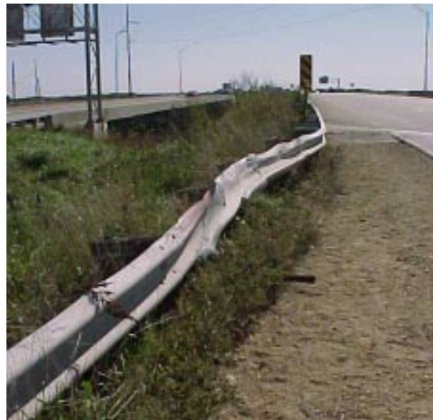
Figure 9. Case I98092303