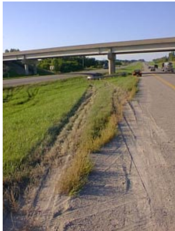
Figure 5. Vehicle approach path in an end-on collision (Case I97090401).

The first nose impact (case I97090401) involved a Freightliner dump truck that lost control due to a blown tire, penetrated the nose of the system, and continued through the guardrail from behind, across the opposing lanes, and into a ditch, where it rolled over. The driver, who was the only occupant, suffered major head injuries. Repairs to the guardrail cost $2205. Figure 5 shows the repaired bullnose and the tracks of the dump truck heading toward the nose.